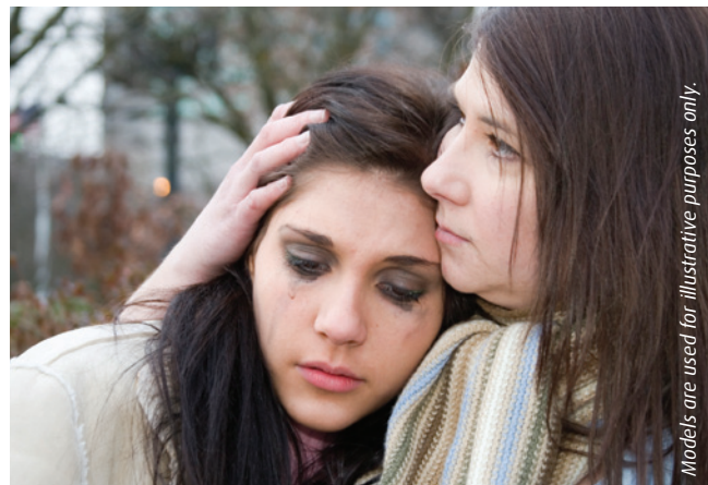
Models are used for illustrative purposes only.

You can help treatment be more effective. Try keeping a chart of your child's moods, behaviors, and sleep patterns. This is called a "daily life chart" or "mood chart." It can help you and your child understand and track the illness. A chart can also help the doctor see whether treatment is working.